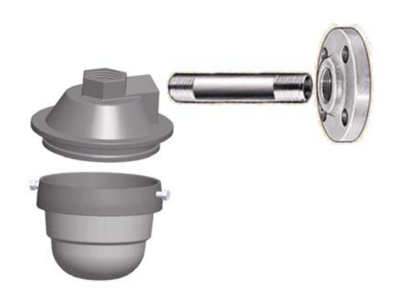
FLush Wall Mount RTO-1000