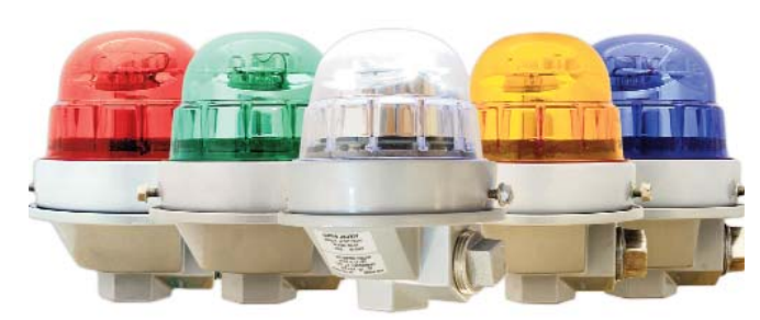
Patents Pending Shown with Junction Box