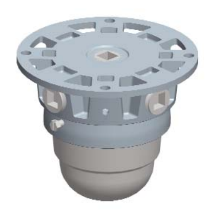
Ceiling Mount Configuration RTO-XX07-005 (w/ Junction Box)