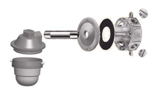
Junction Box Wall Mount RTO-1001

Dialight reserves the right to make changes at any time in order to supply the best product possible. The most current version of this document will always be available at: www.dialight.com/Assets/Brochures_And_Catalogs/Illumination/MDTFCVSLX001.pdf