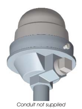
Pendant Mount Configuration RTO-XX07-001 (w/ Junction Box)