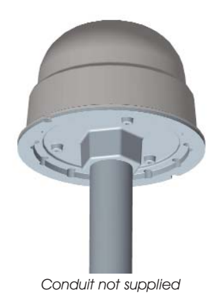
Pendant Mount Configuration RTO-XX07-004